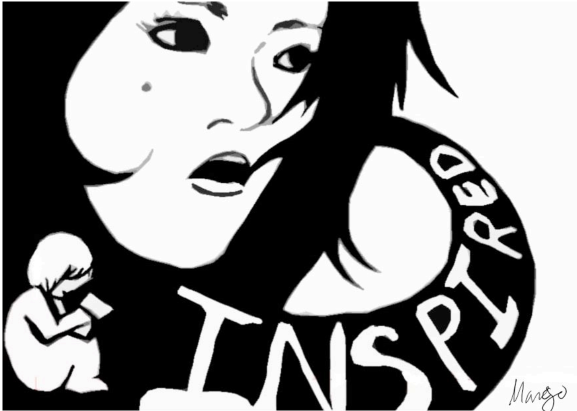
Figure 1. Mango's Drawing, March 2010

In closing, consider Mango's drawing (Figure 1), which represents these students' views. This drawing demonstrates her growing passions for an artistically inspired life. Here, Mango